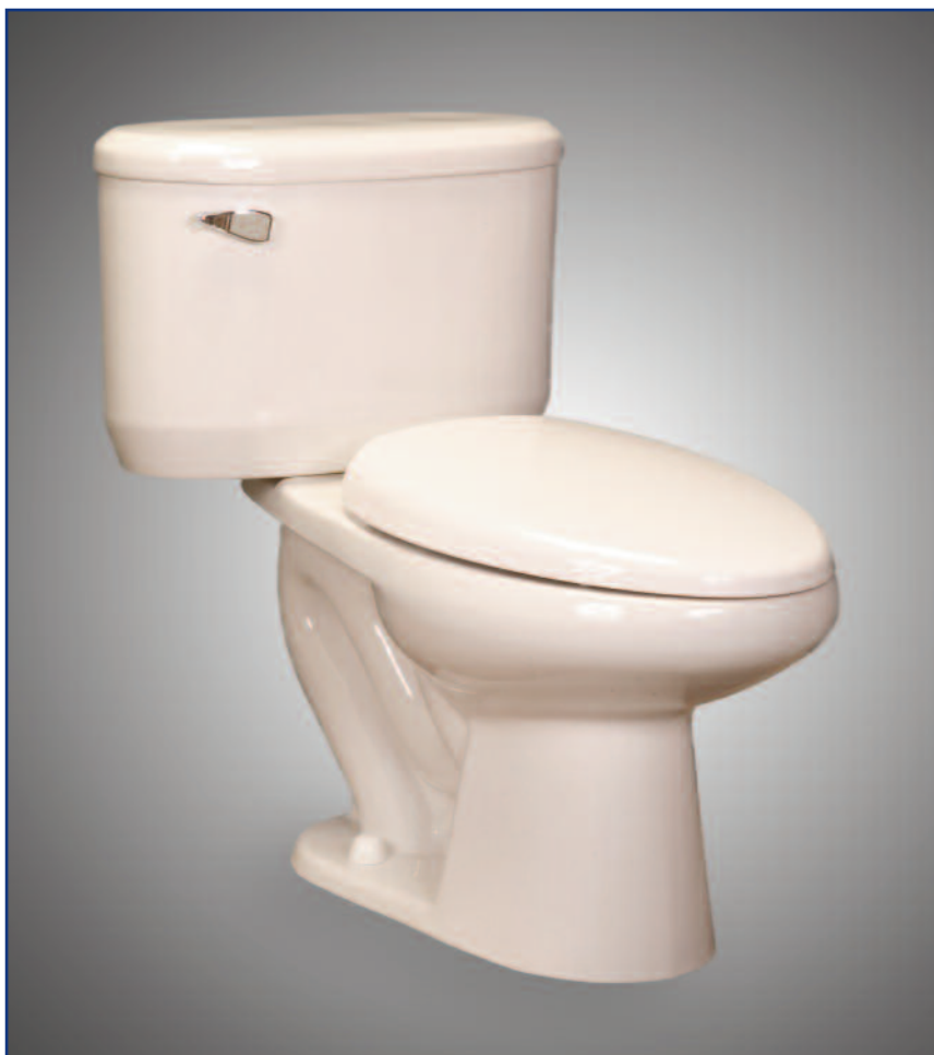
With Western the water savings are significant and maintenance is minimal.

Our customers tell us it's "The Best Flushing Toilet in America!"