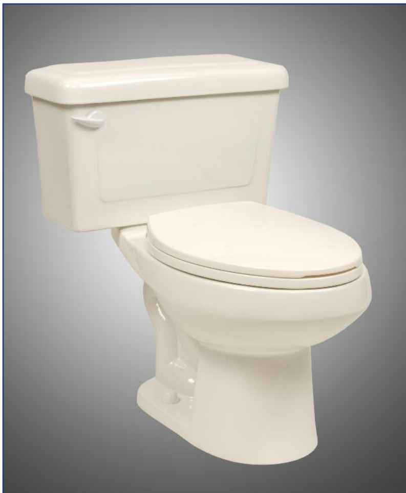
With Western the water savings are significant and maintenance is minimal.